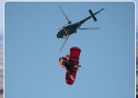
SEARCH AND RESCUE